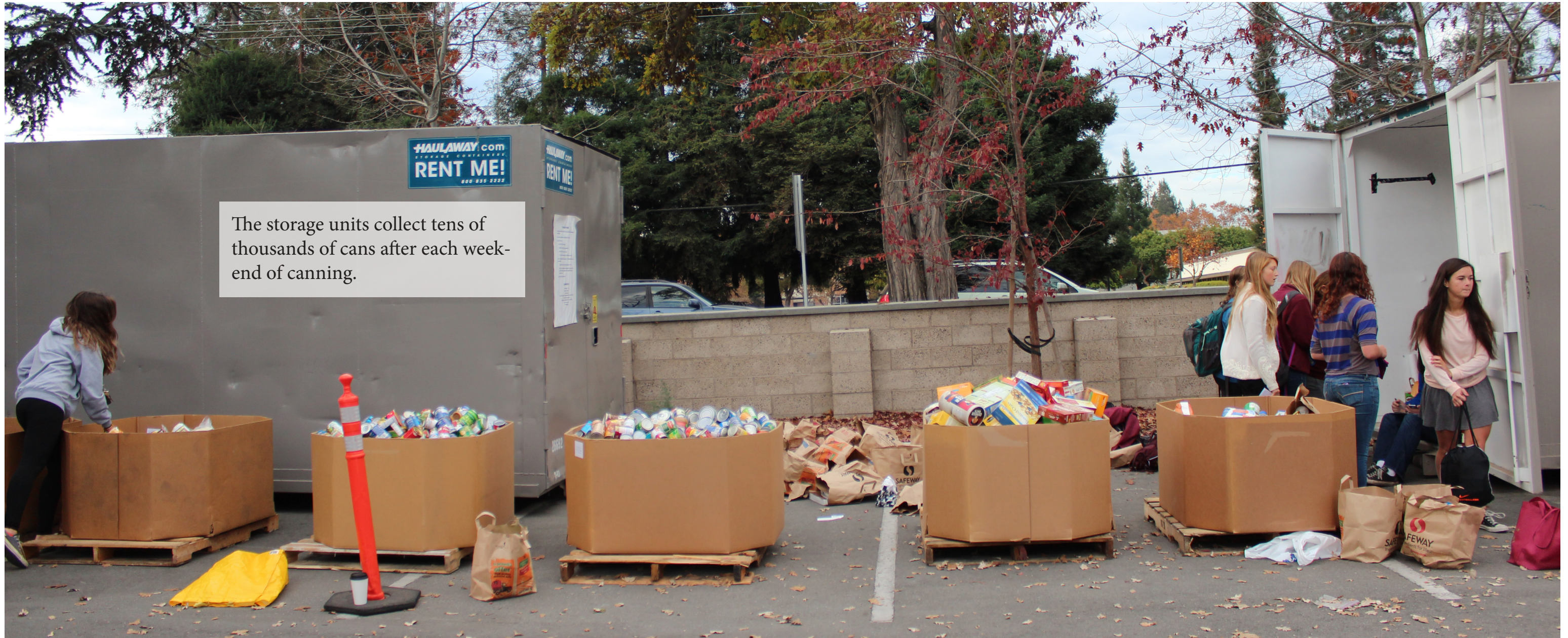
The storage units collect tens of thousands of cans after each week-end of canning.