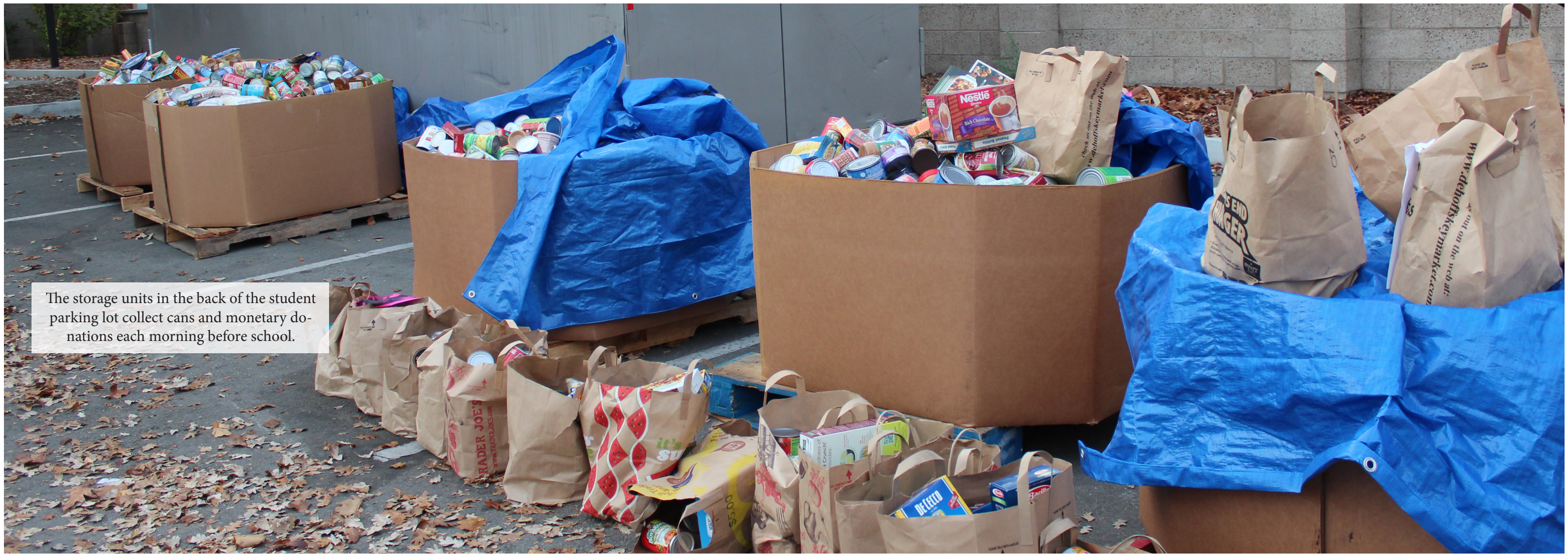
The storage units in the back of the student parking lot collect cans and monetary donations each morning before school.