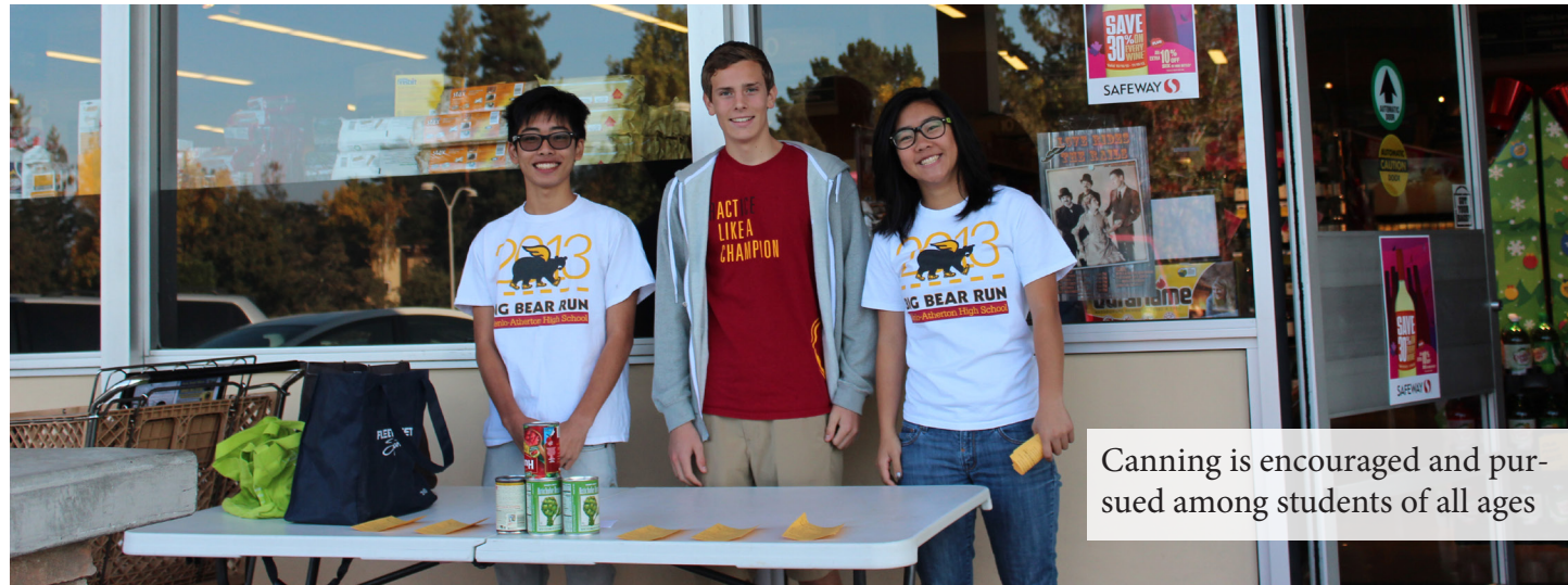
Canning is encouraged and pursued among students of all ages