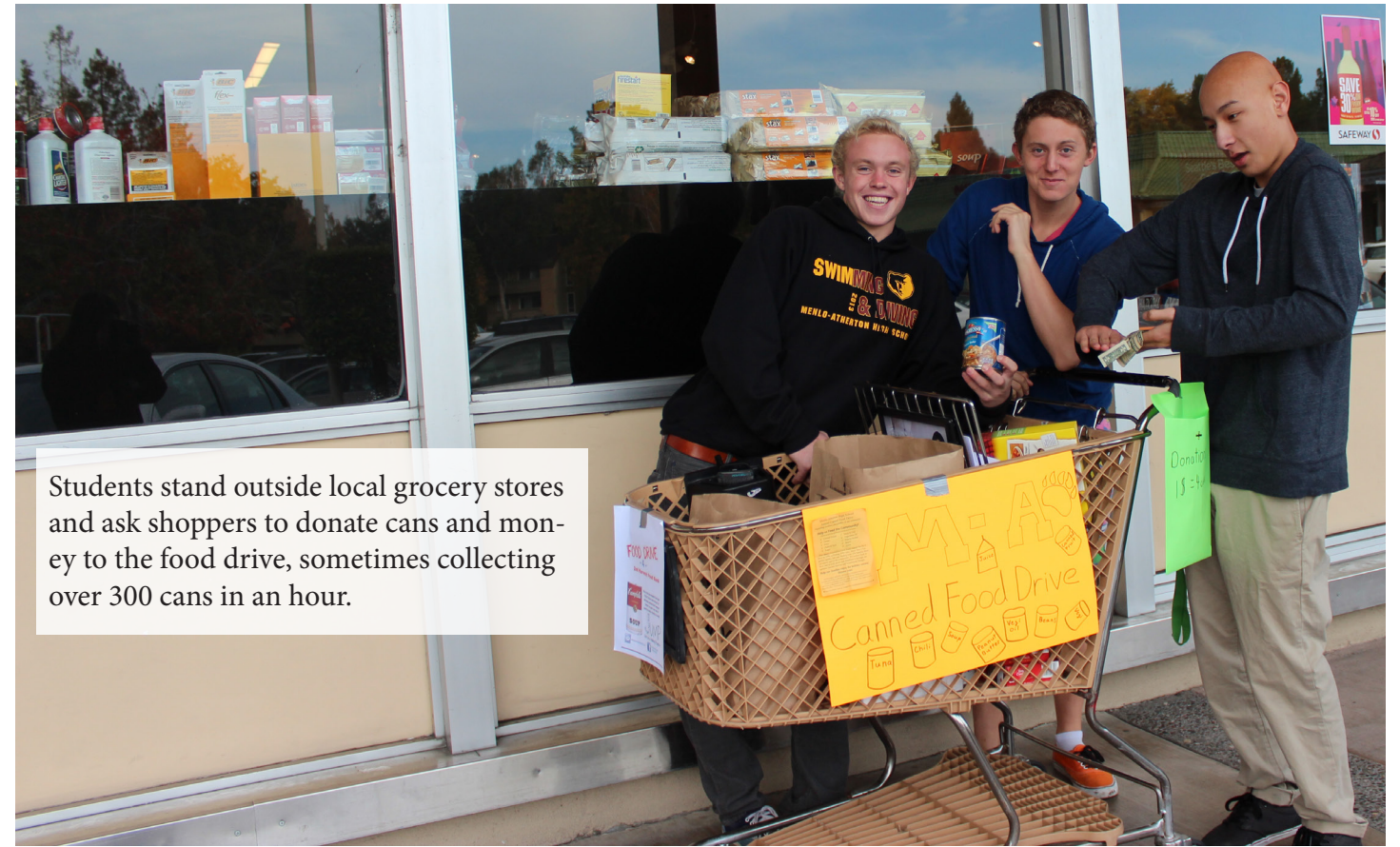
Students stand outside local grocery stores and ask shoppers to donate cans and money to the food drive, sometimes collecting over 300 cans in an hour.